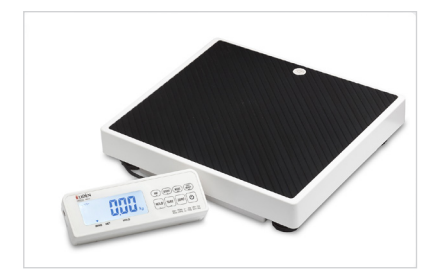
Removable display with clear numbers which makes it easy to read the weight