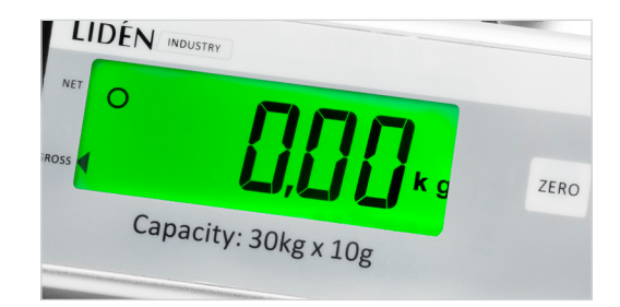
25 mm LCD display with backlight