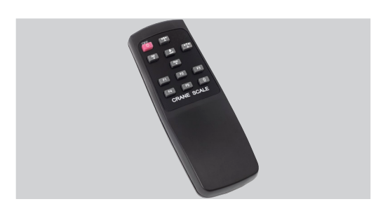
User-friendly remote control